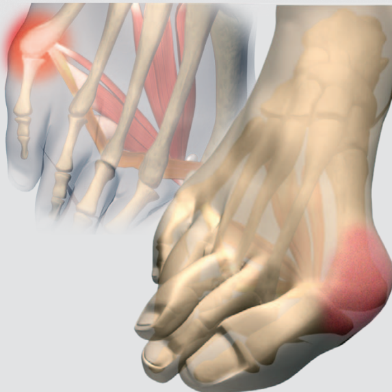
The most common bunion, Hallux Abducto Valgus, is shown lower right. Less common, but related to the same biomechanical problem, is the Tailor's Bunion shown upper Left

Correct fitting shoes are essential to addressing the pain from a bunion that may be caused by rubbing against the inside of the shoe. Corns and calluses should be treated as well. Felt padding can be used to buffer the bunion against the shoe. Padding can also be placed in between the big toe and the second toe which may lessen some of the pain. Keep in mind that these options can help the symptoms, but do